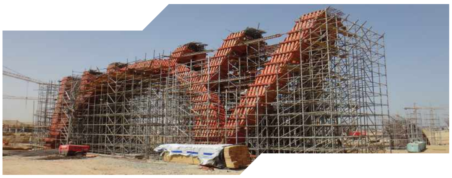
KAIA, Jeddah, KSA