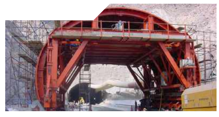
Wadi Muddiq to Gillay Tunnel, UAE

High Quality, tailor made designs for each new project, built on over 65 years experience.